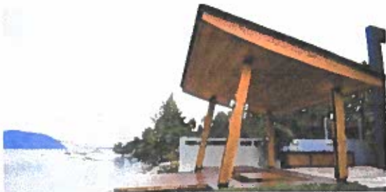
Partially covered pavilion/lookout point