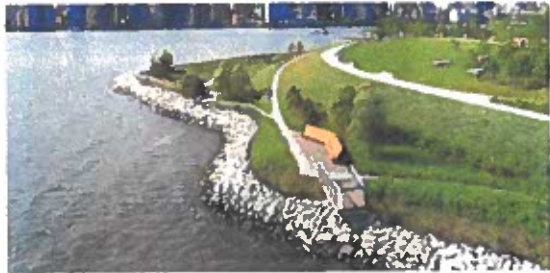
Lookout points along the shoreline