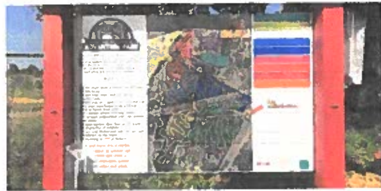
Trailhead signage mapping sections of the trail