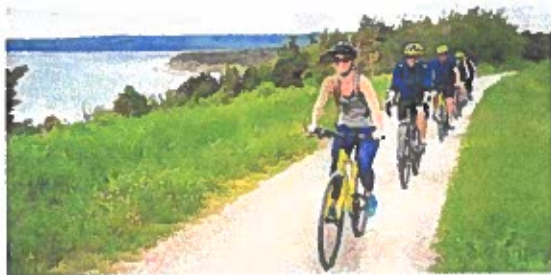
Granular trail along the shoreline