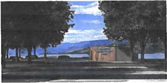
Gateway signage at entrance to parking lot & Boat launch