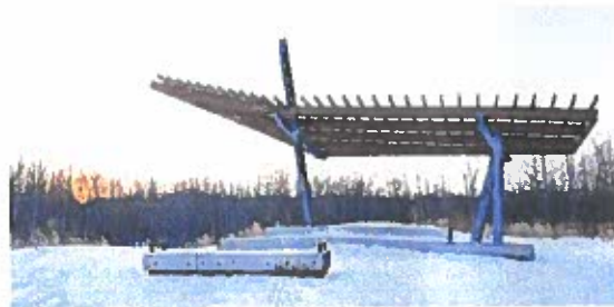
Shade structure along dock lookout area